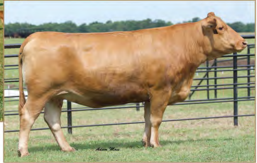
RMW HOSHICO D18 • Dam of Lot 1