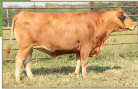
MPA RAPID BAY NATSUKI 01D ET • Dam of Lot 37