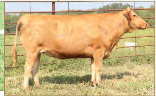
TJ MS HOMARE 718B • Dam of Lot 31