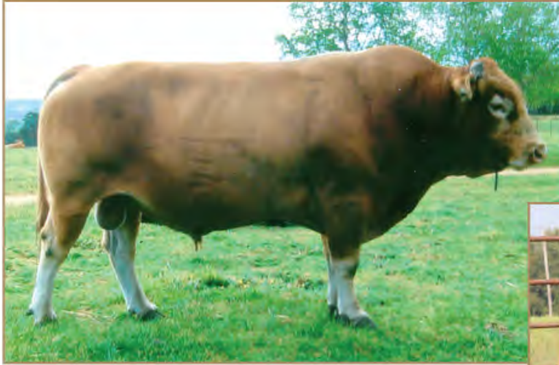
ASHWOOD PARK VIRILE • Sire of Lot 22