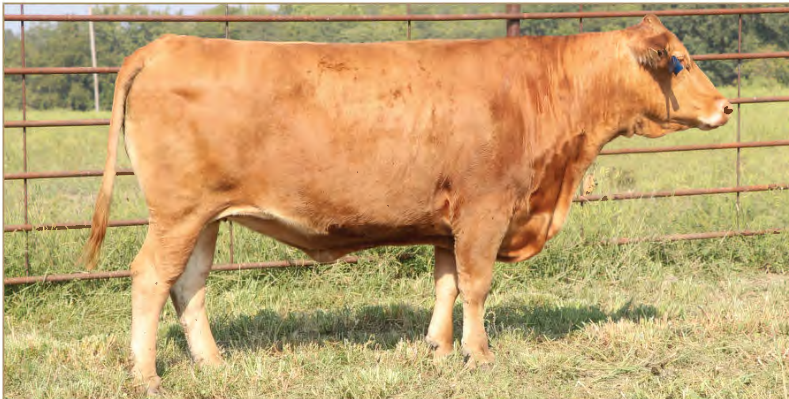
RAPID BAY NATSUKI ET • Dam of Lots 21A, 21B & 21C

FULLBLOOD AKAUSHI • COW • RED PENDING • HORNED • 10/14/2025 • MPA M53