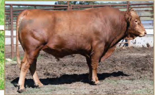
HEARTBRAND PHOENIX 1398F ET • Sire of Lot 29

Prior to the sale all current weights, BW, WW and YW will be on the supplement sheet.