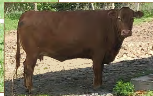
RAPID BAY JOJO ET • Dam of Lot 2

FULLBLOOD AKAUSHI • COW • RED AF329454 • HORNED • 9/16/2023 • MPA M22