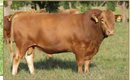
HEARTBRAND JOE S5394S • Sire of Lot 18

FULLBLOOD AKAUSHI • COW • RED AF380110 • HORNED • 10/9/2023 • MPA M75