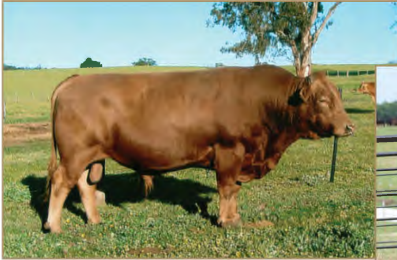
TWA KOTSUKARI • Sire of Lot 1