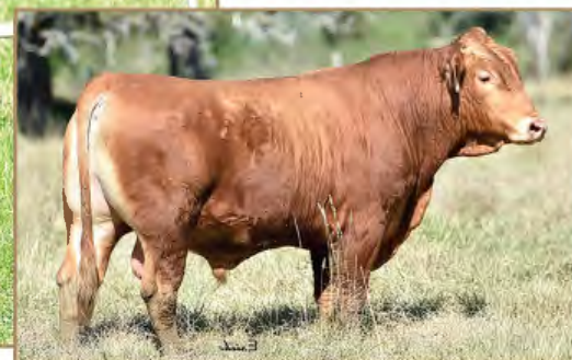
SOR HASTINGS 1066C ET • Sire of Lot 13