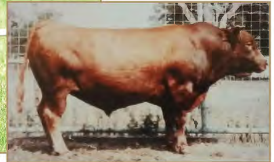
JUDO 1223 • Sire of Lot 32

FULLBLOOD AKAUSHI • BULL • RED AF329465 • HORNED • 3/20/2024 • MPA M114