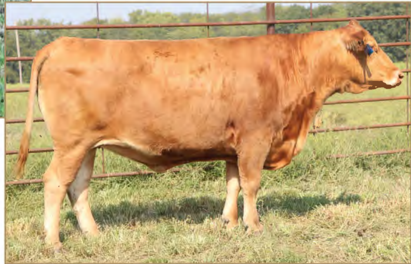
RAPID BAY NATSUKI ET • Dam of Lot 23