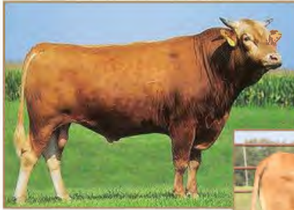
TAMAMARU • Sire of Lot 37