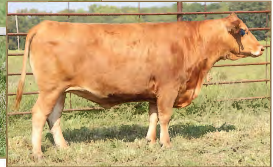
MPA RAPID BAY NATSUKI 01D ET • Dam of Lot 39

FULLBLOOD WAYGU • BULL • RED FB130767 • HORNEDED • 8/22/2024 • MPA M123