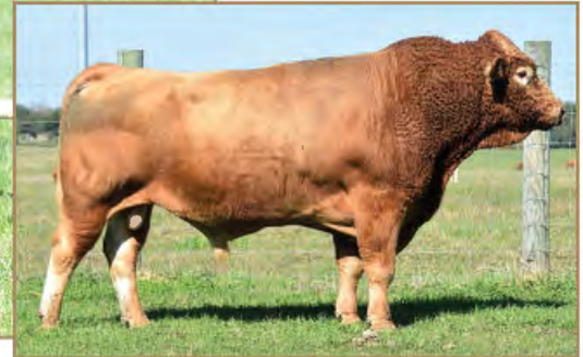
HEARTBRAND HEAVY HAULER 3199A • Sire of Lot 12

FULLBLOOD AKAUSHI • COW • RED AF359458 • HORNED • 3/31/2024 • 71