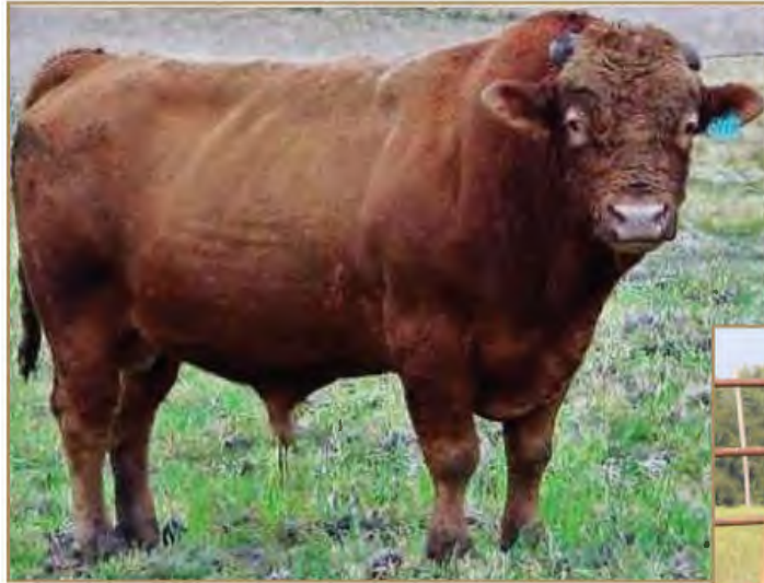
RED EMPEROR • Sire of Lot 23