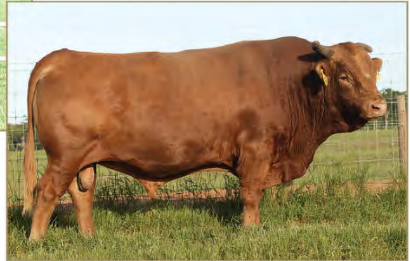
HB BIG AL 502 • Sire of Lot 11