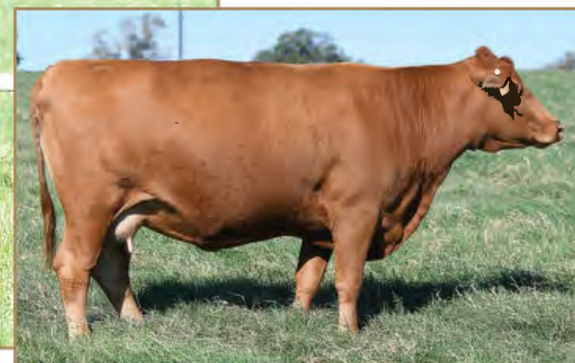
HEARTBRAND 3117A ET • Dam of Lot 3