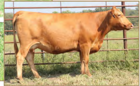
BSCC MS BIG AL E244 • Dam of Lot 8