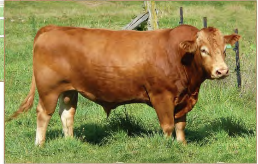
THE WRIGHT WAGYU MASTER CHEF E146 • Sire of Lot 5