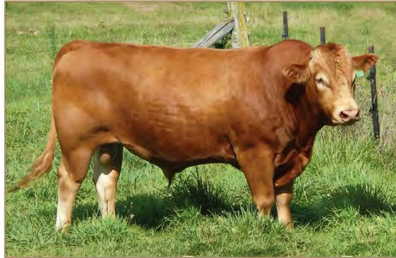
THE WRIGHT WAGYU MASTER CHEF E146 • Sire of Lot 24