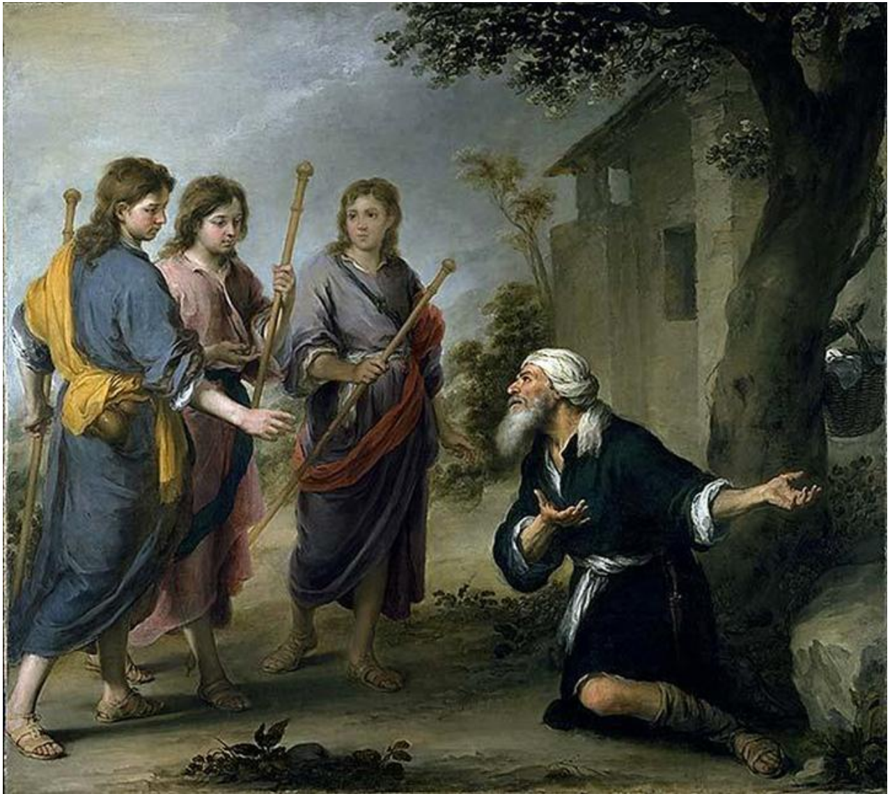
"Abraham Receiving the Three Angels" by Bartolomé Esteban Murillo