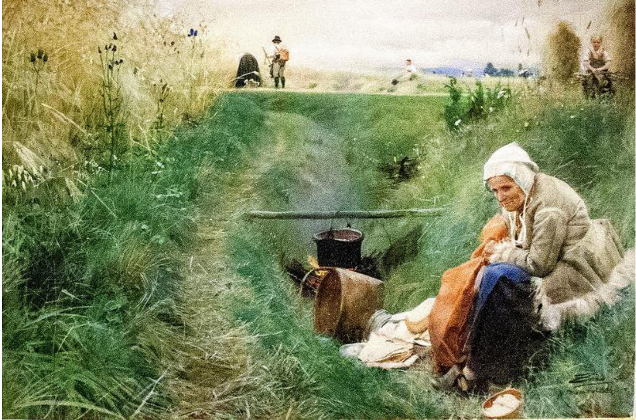
"Our Daily Bread" by Anders Zorn

First Reformed Church of Hastings-on-Hudson is a church for all people, each of us being unique and created in the image of God.