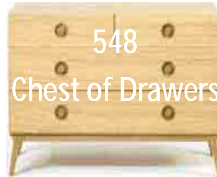
548 Chest of Drawers