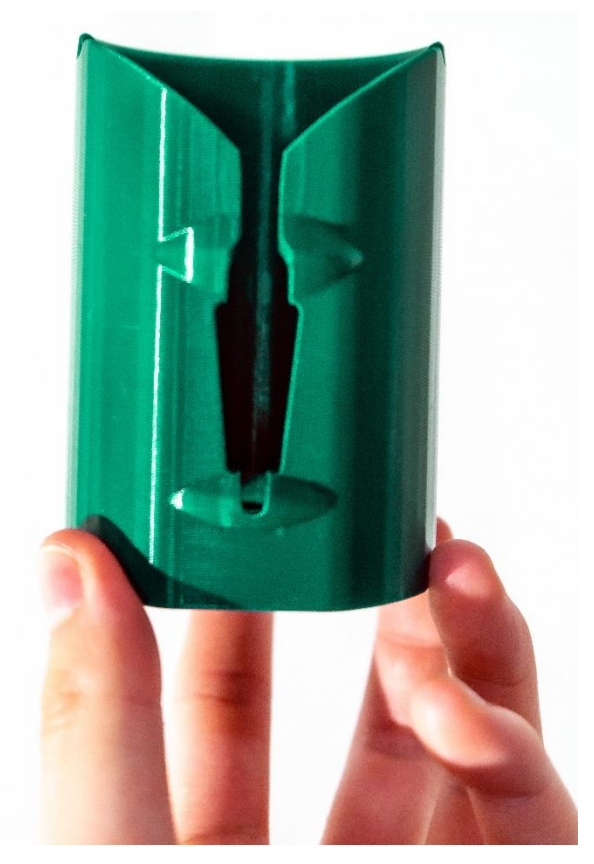
Figure 4. DECAP functional piece prior to SLA inserts, printed on Creator 4 Pro

Furthermore, it allows for changing materials, and colors at a moment's notice for evolving