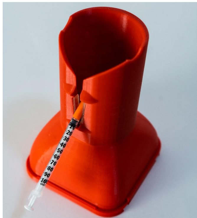
Figure 2. DECAP Set with needle

Figure 1. Guider 3 Plus with special DECAP parts