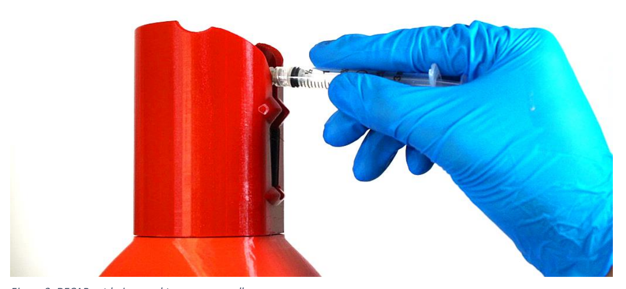
Figure 3. DECAP set being used to recap a needle