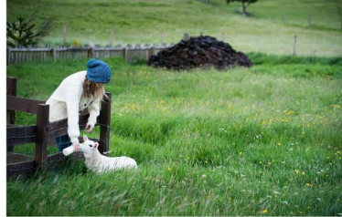
LAMB FEEDING, SHEEPDOG DEMONSTRATIONS