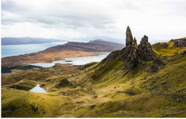
OLD MAN OF STORR

full day of exploring isle of skye, so our hotel will be the same as the night before