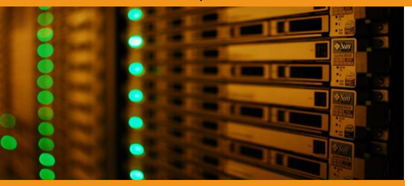
ExoQ™ Enabling High Performance Mining