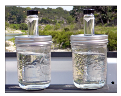
The effluent sample on the left, discharged from an Orenco AX100 Treatment System, is as clear as the water sample on the right, taken from a nearby lake.

The LEED certification mark is a registered trademark owned by the U.S. Green Building Council and is used by permission.