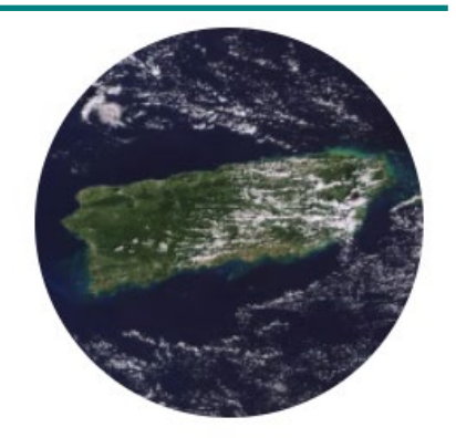
Puerto Rico, USA