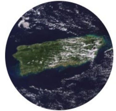
Puerto Rico, USA