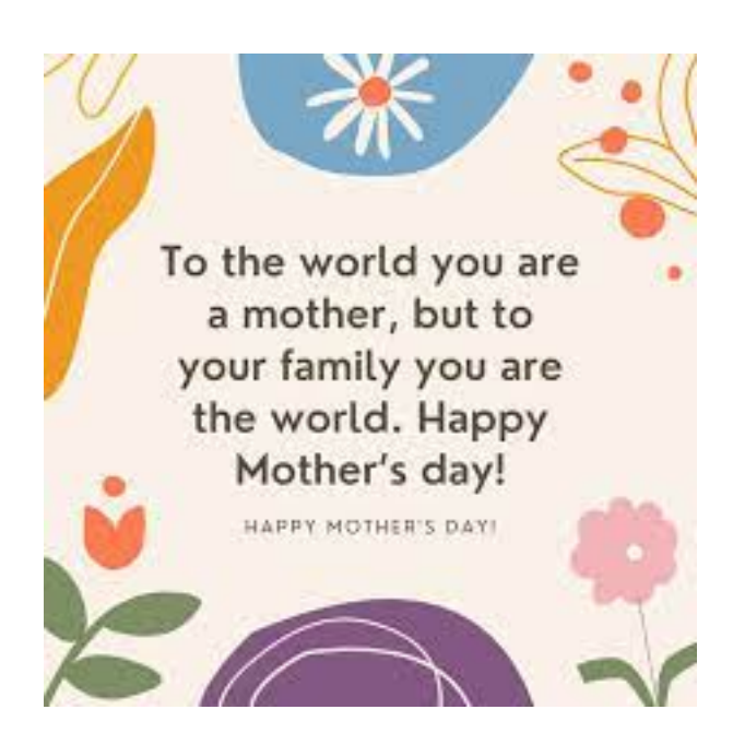
Happy Mother's Day to one and all!

To read this article in full, please click here.