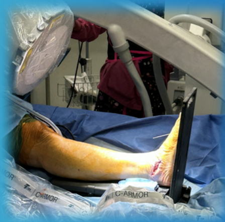
Using The Weight Bear