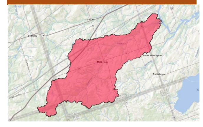
The subwatershed of the Baxter Creek which is the focus of our watershed characterization mapping efforts.

Our Fleming college students who worked with us this Spring as our GIS Technicians will be presenting their work and <u>Baxter Creek Watershed Hub</u> in a virtual online GeoCommunity Open House on June 30th.