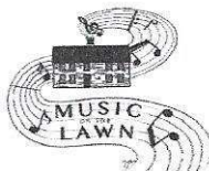
Music on the Lawn