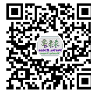
Dragon Steppers Parent Group Chat