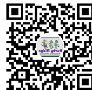
Dragon Steppers Parent Group Chat