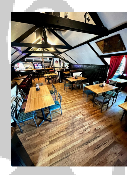
Downstairs Pub Maximum 60 people