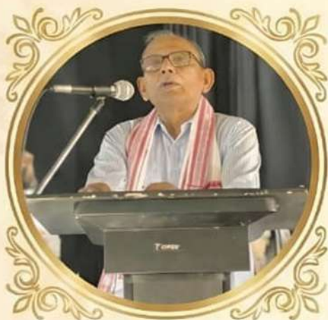
Retired Senior Academic Officer, SEBA

MA in English Literature from Dibrugarh University, MA in Linguistics from Reading University, United Kingdom, Post Graduate Diploma in Teaching English from English & Foreign Languages University, Hyderabad.