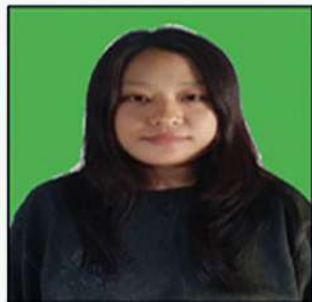
ATOI W KONYAK NAGALAND