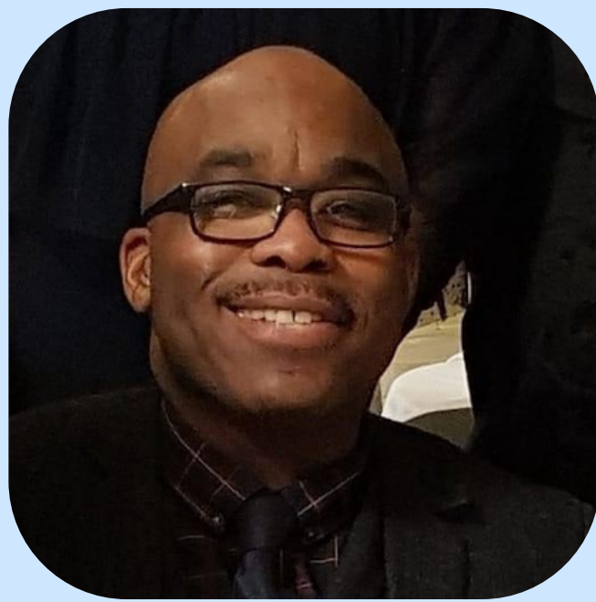
MINISTER ERROL GIBBONS