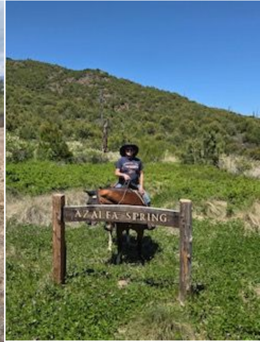
Bev Wagner at Azalea Springs