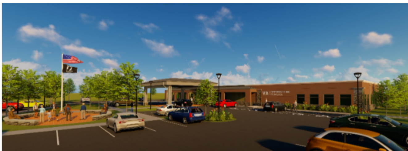
Brunswick, GA VA Clinic