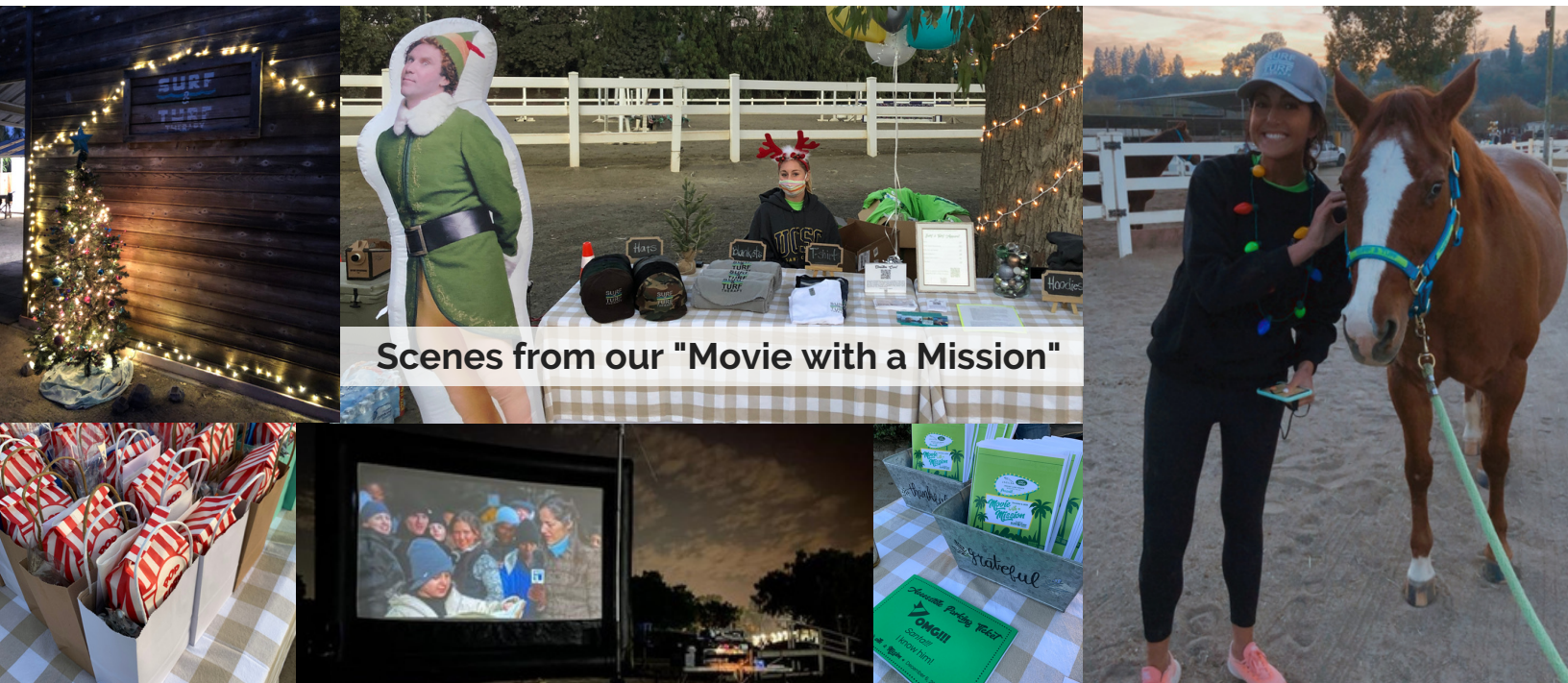
Scenes from our "Movie with a Mission"

22% of participants received financial aid