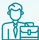
Wealthy Global Citizens

Wealthy Global Citizens, Wealthy Pensioners, Work-from-Thailand Professionals, and Highly Skilled Professionals. Spouses and dependants of LTR visa holders will also qualify for the same visas.