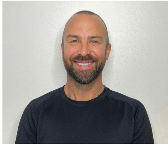
Director & Lead Hair Stylist