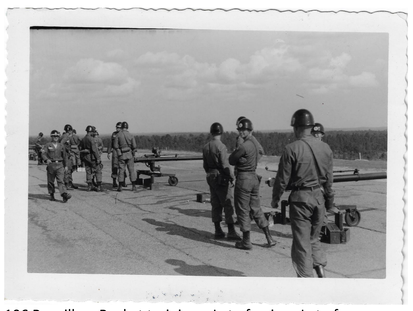
106 Recoilless Rocket training – Lot of noise - Lot of milling around.