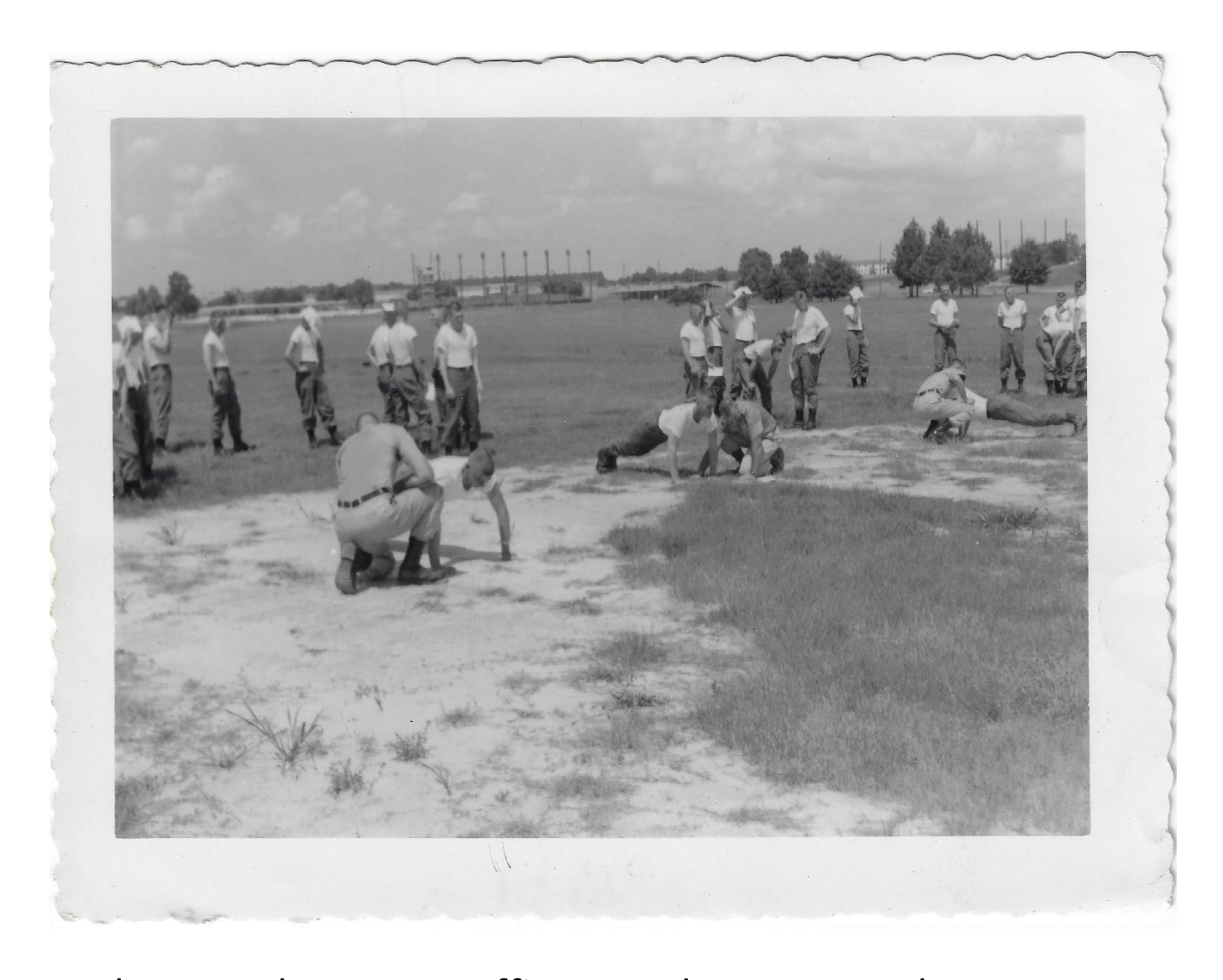
Push up – When a TAC officer got down on one knee to give one on one training you were in trouble.