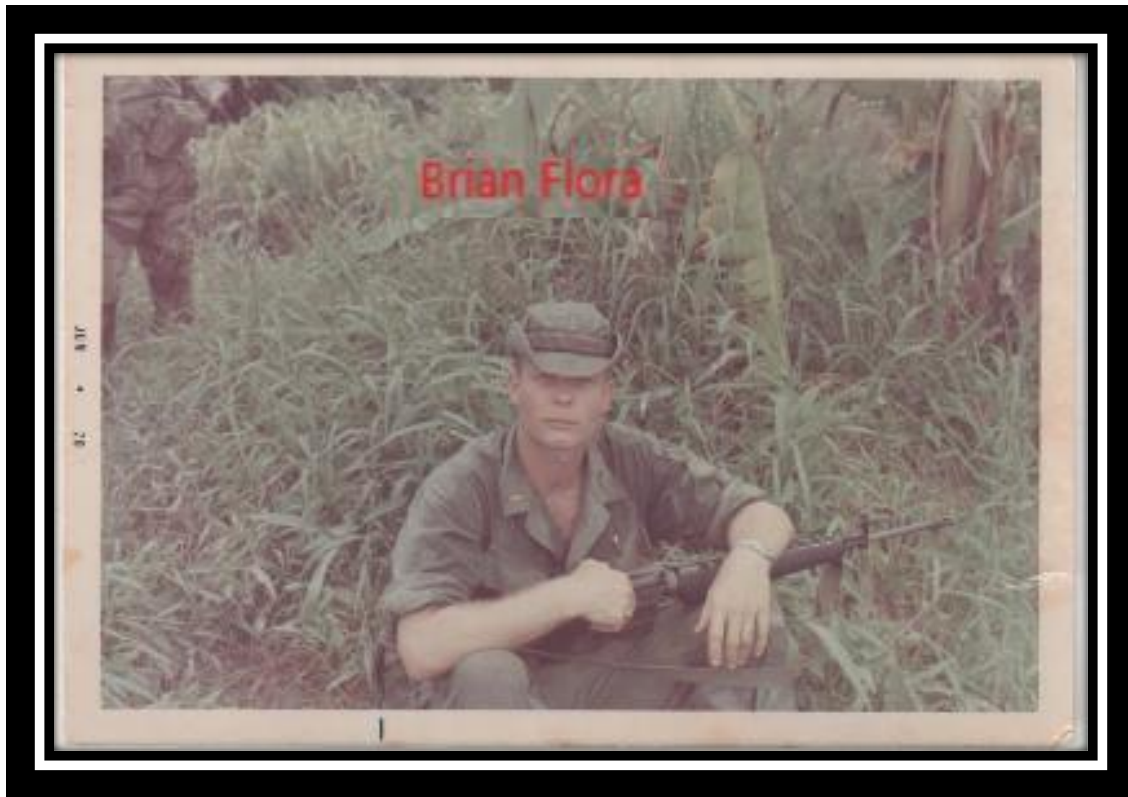
Second Looie: Second Looie (or a freshly minted First Looie) out on an operation with the village PF militia.