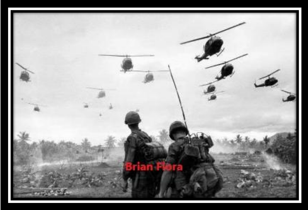
Air Assault: Air assault up north in Two Corps. Photo sent to me by a frie