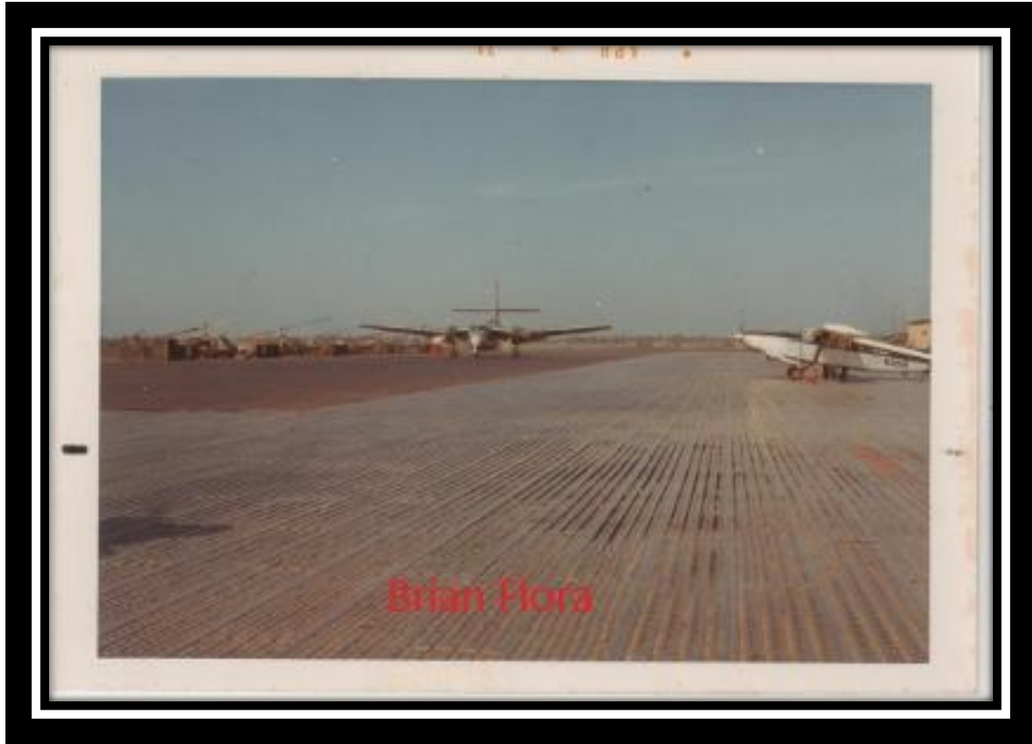
Airfield: Provincial airfield in the Delta. Can Tho, I believe. Note the PSP (perforated steel planking) runway and the C-130 rolling down the track.