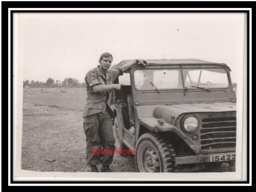
Jeep Picture: I was jeeping along a dirt road in Vinh Binh Province on some sort of make-work mission for the provincial MACV headquarters and some local VC fellow trying to make a name for himself rose up out of a rice paddy and popped an AK-47 round through the windshield. Scared the Ba-Jesus outta me. Here's me pointing at the hole.