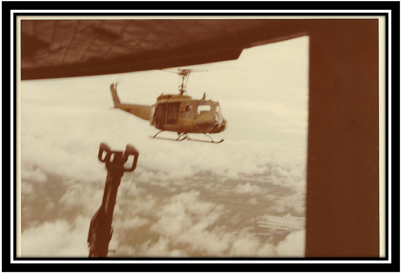
Flight of five helicopters in staggered left formation. Flying above the clouds during monsoon season