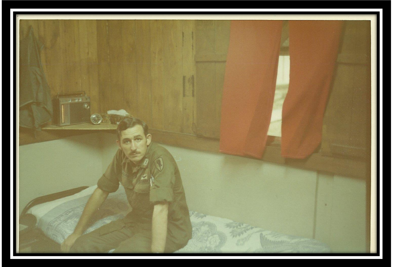
Aviators had comfortable living quarters