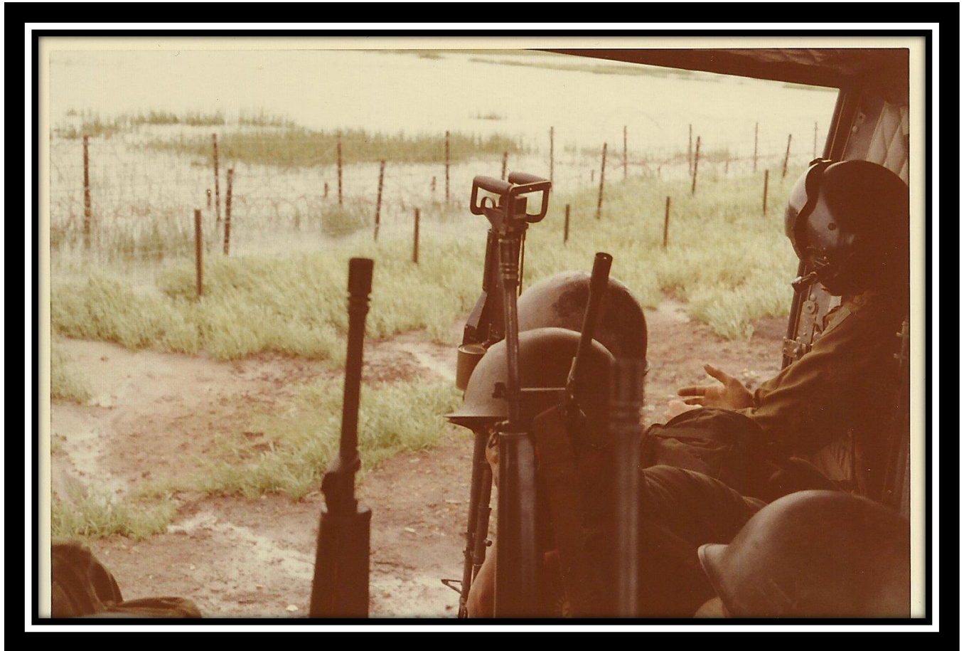
Aircraft is loaded for combat assault mission