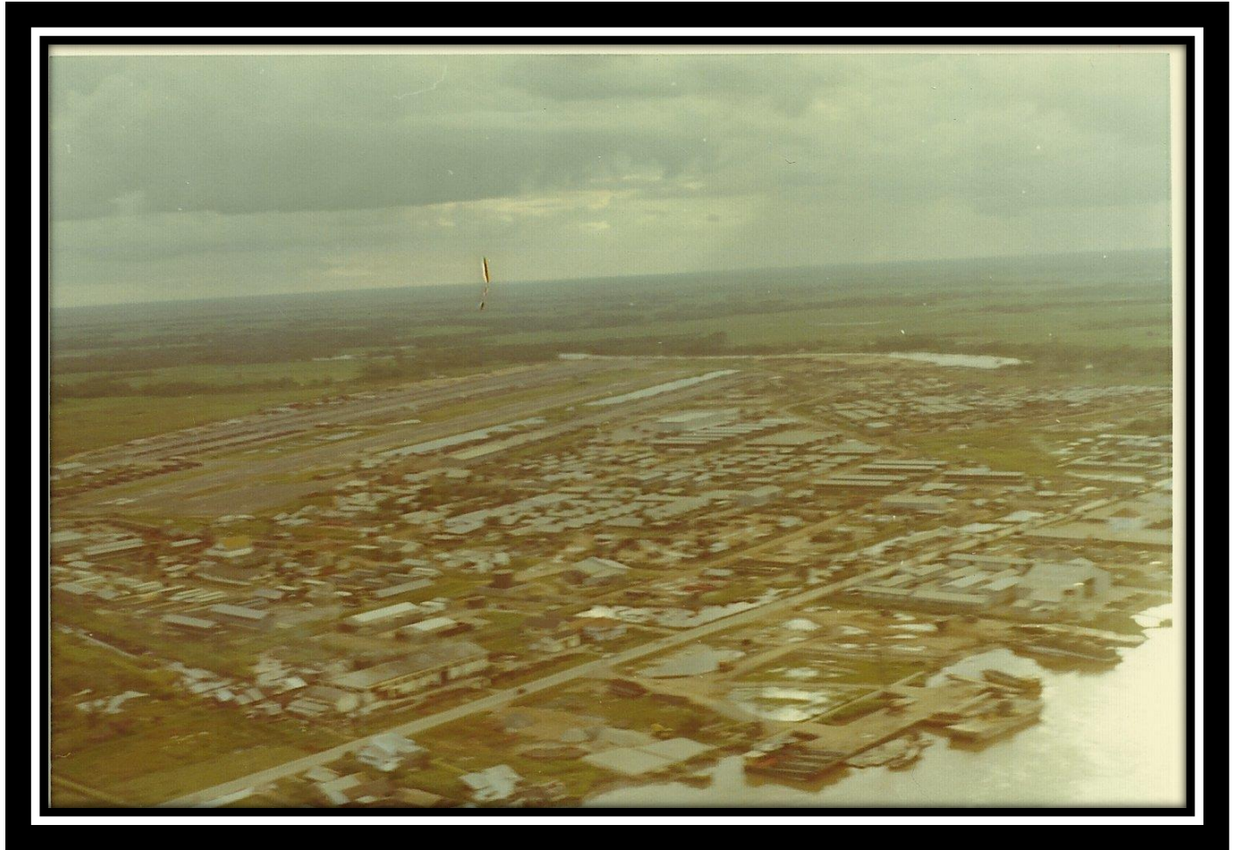
Vinh Long Army Airfield located along the Mekong River.