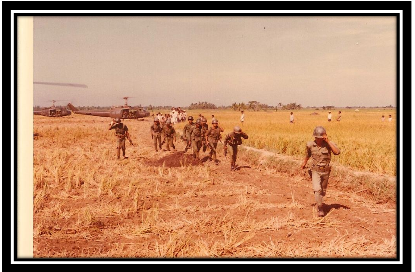
ARVN soldiers in dry season, rice paddy pick-up zone. Vietnamese civilians harvest rice across the dike.