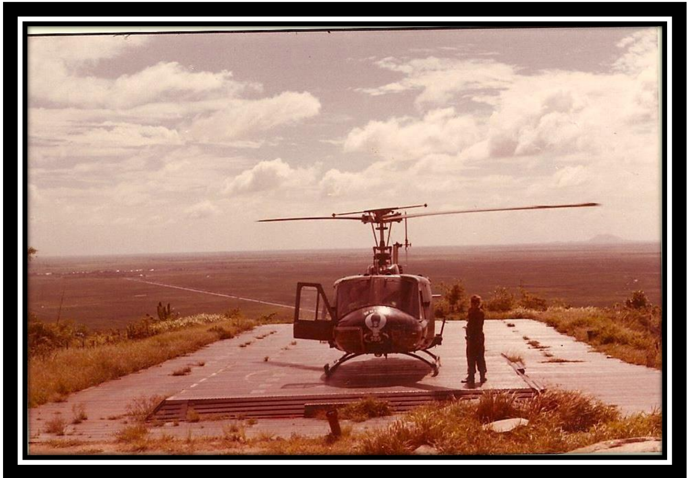
The Seven Mountain Range runs from Chi Lang to Chau Doc along the Cambodian Border. Helicopter is parked on Twin Sisters Mountain. Nui Ba Den (Black Virgin Mountain) in III Corp can be seen on the horizon.