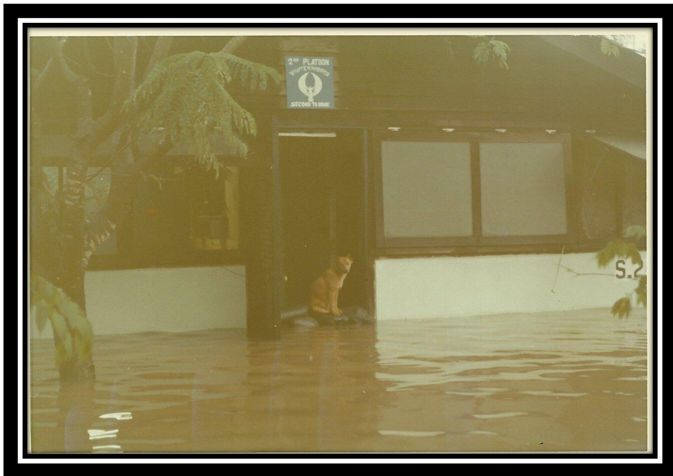
Monsoon season comes to the Hootch. Platoon mascot, Short Round, views the water.