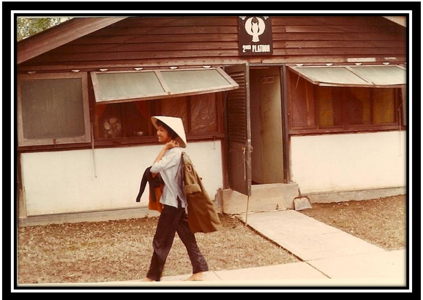
My assignment was with the 114th Assault Helicopter Company "Knights of the Air". The unit was located at Vinh Long in the Mekong Delta. The White Knight Hootch was my home. Note entrance