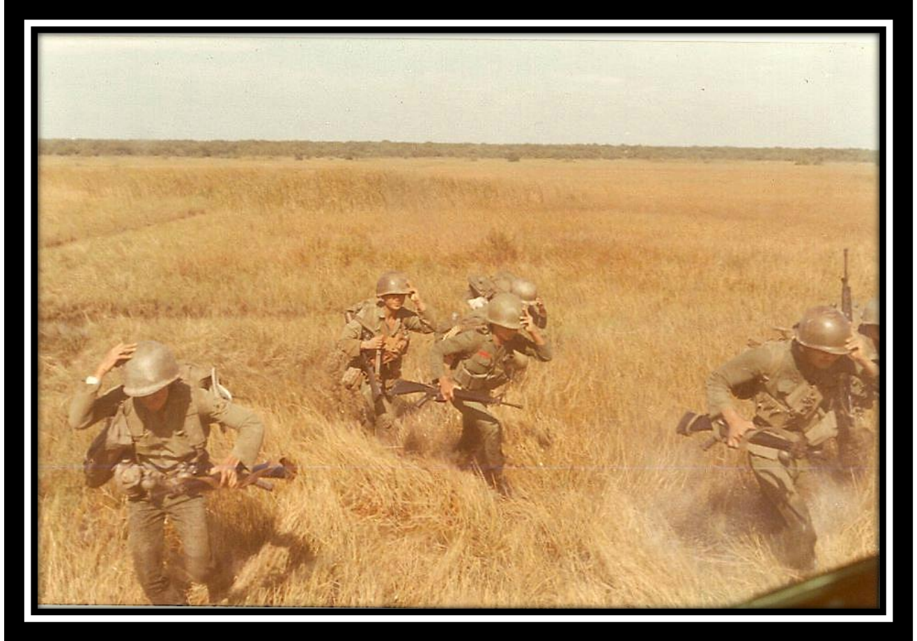
Loading another lift of soldiers in a pick-up zone