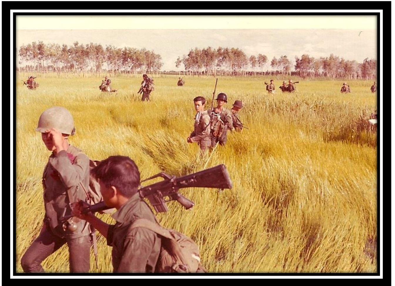
ARVN soldiers conducting operations in a non-hostile landing zone. Multiple medivac missions later. The area was booby trapped.