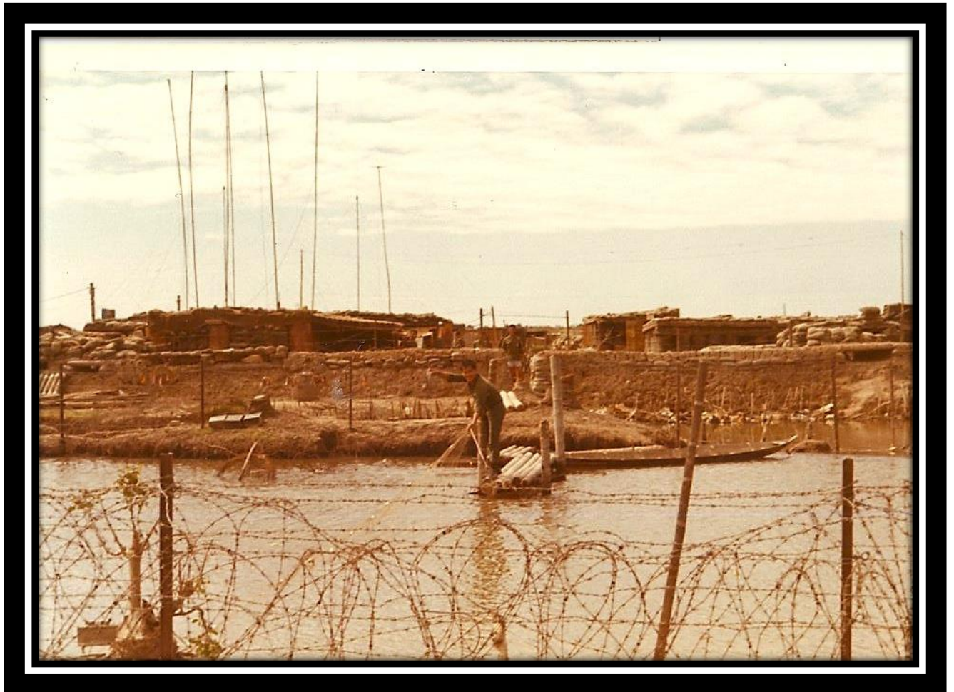
Another outpost somewhere in the Delta