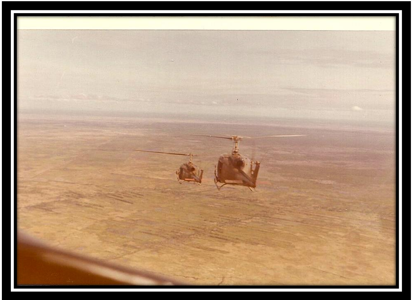
Dry season in the Delta. Flight of five helicopters in trail formation. Mekong river shown in photo.