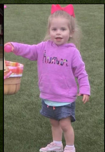
Extra baskets taken to the Naval hospital on base !! OORAH !!