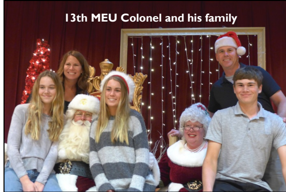
13th MEU Colonel and his family

2019 was another great year for the 13th MEU and the holidays were above what we could have ever imagined. The support of so many humbled us and was such a blessing to our families. We were able to put on a party that won't soon be forgotten. The excess donations were shared with the 15th MEU and the kids in the hospital. The single Marines enjoyed a yummy traditional Christmas dinner and we were able to assist more Marines with transportation costs to get home for the holidays this year than ever. A huge THANK YOU to everyone who went above and beyond this year in donations of time, money, gift cards, toys and raffle prizes !! We cannot do any of this without all of you !!