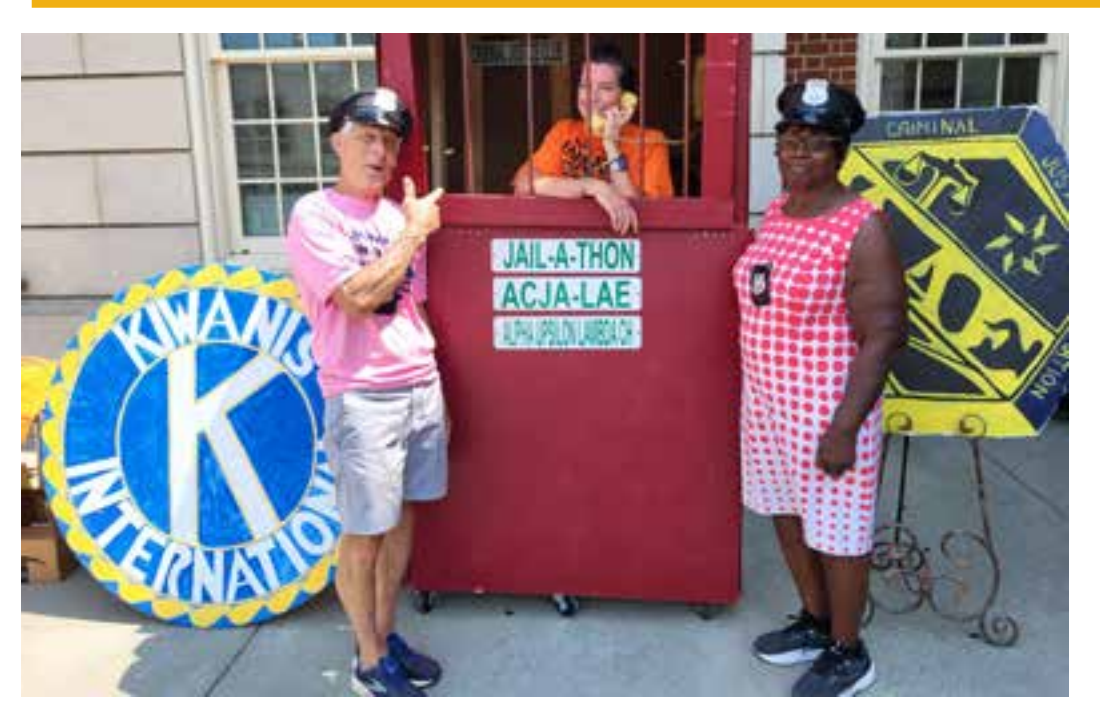
July 31, 2024 combined AUL-Kiwanis Club 4th Annual Jail-A-Thon at the James F. Ingram Criminal Justice Center