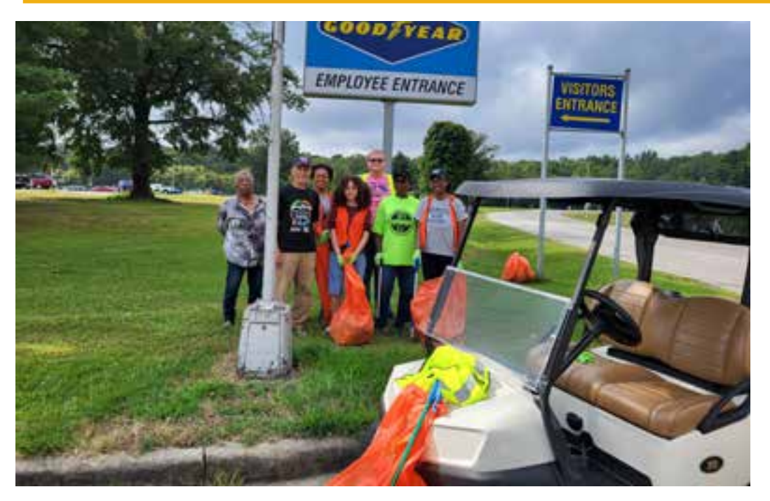
August 31, 2024 AUL Litter Project on Goodyear Blvd.