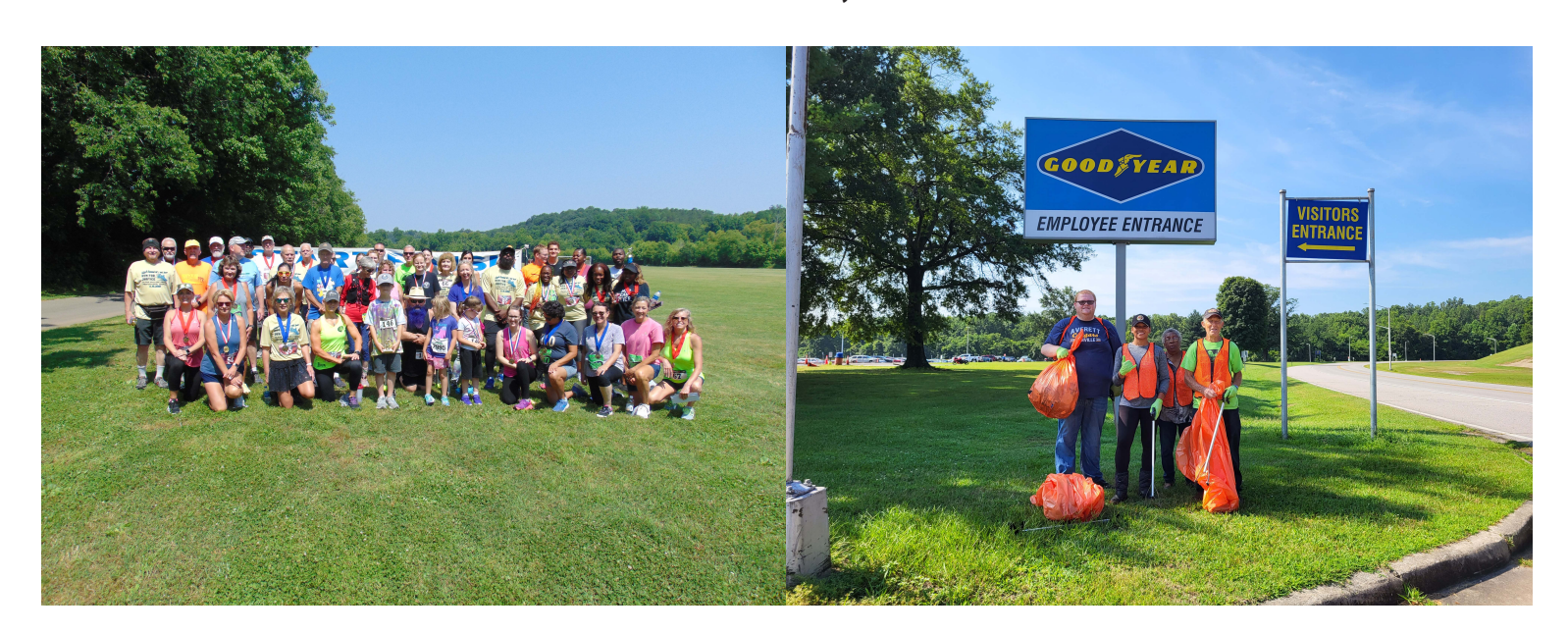
June 18, 2023 21st Annual "Run for Justice" at Angler's Park