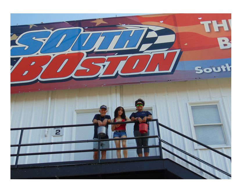
"50-50" August 2023 Fundraiser at South Boston Speedway