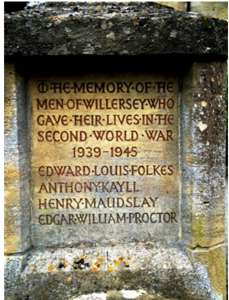
Willersley War Memorial, St Peter's Churchyard