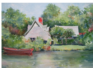
"Willie Lott's Cottage," Demo/Paint-Along.

Minimum to open Workshop is 6 students. All Levels Welcome!