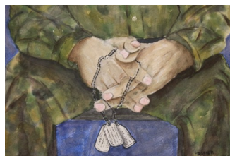
Some Gave All

viewer into her paintings, allowing them to stroll around awhile and be entertained with the subject matter.