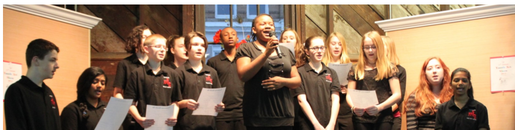
Mooresville Middle School Choir Performing at the 2015 Youth Art Show Reception and Awards Ceremony.

Music Performance by The Mooresville Middle School Chorus