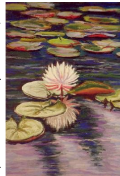
Bass Lake Lilies