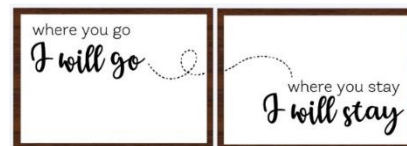
Pair of Gallery Signs Couple's Project

You will choose from 12 different stain colors and 40 different paint colors. You can do everything freehand or use one of the many stencils provided. Beyond, that, the most important thing to remember is to bring your creative mind. Everything is completely personalized! If you want to see your favorite quote or saying, or your last name and established date, you can make that happen!