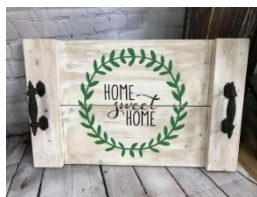
Farmhouse Tray Individual Project

Tuesday, February 12 from 7:00 PM –10:00 PM