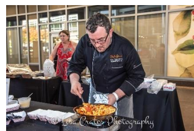
Market Your Business

Mooresville Arts Special Programs are FREE to anyone interested in catching up on what's happening at Mooresville Arts, learn a new technique or process, and best of all, socialize with peers.