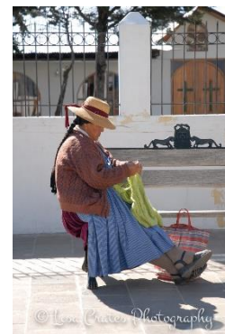
Create Art Reference Material