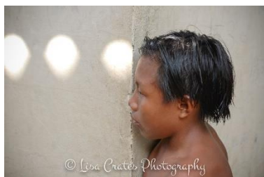
Share with Family