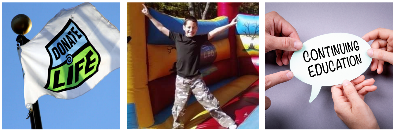
Call to Action

April is National Donate Life Month. Learn about opportunities to raise awareness in your hospital and community