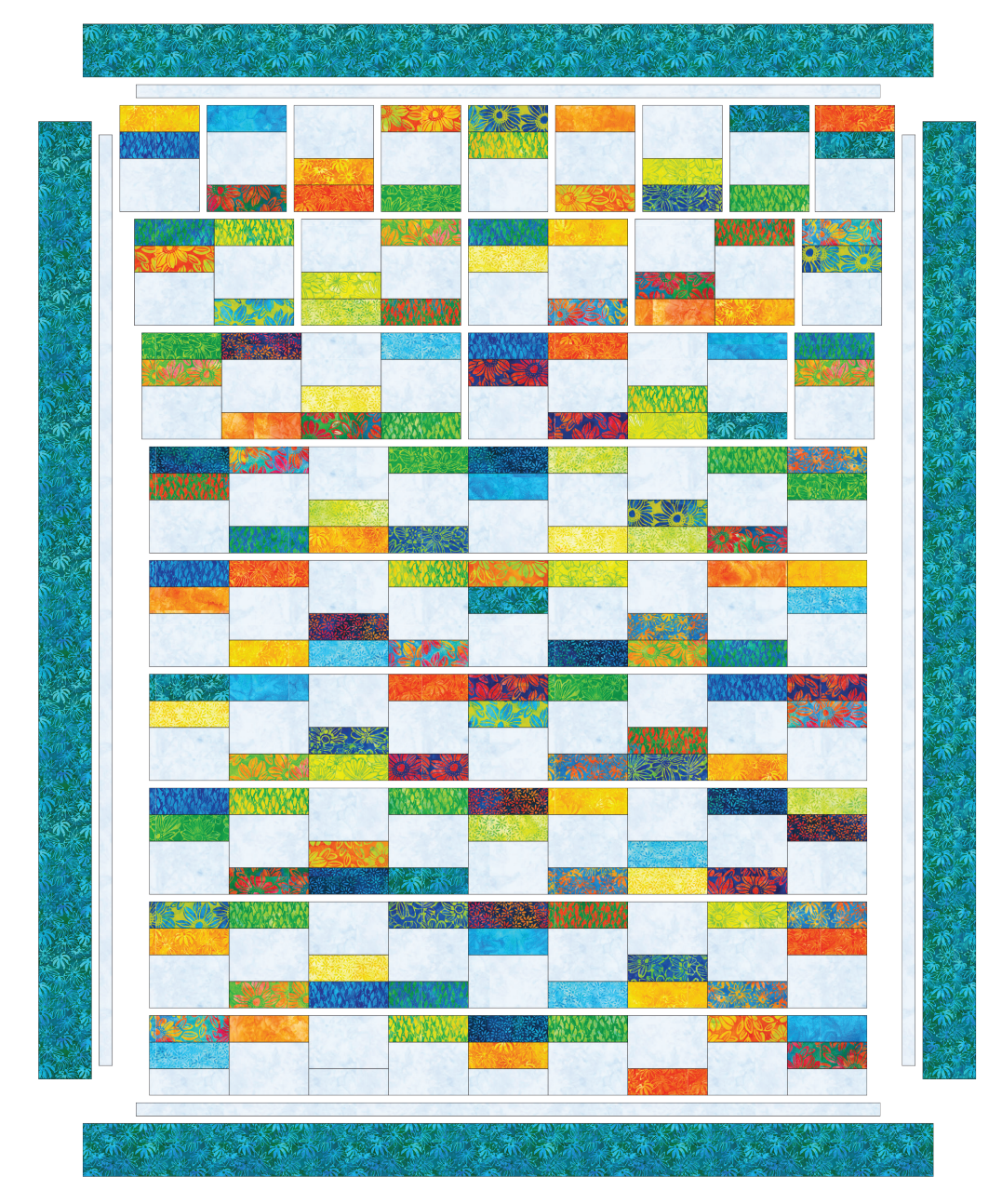
Step 8: Sew the side inner borders to the sides of the quilt center. Press toward the borders. Sew the top and bottom inner borders to the quilt center. Press toward the borders.

Step 9: Sew the side outer borders to the sides of the quilt center. Press toward the borders. Sew the top and bottom outer borders to the quilt center. Press toward the borders.