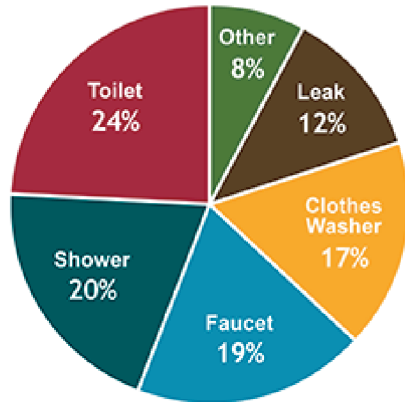
Source: Water Research Foundation, Residential End Uses of Water, Version 2. 2016

The average person uses 101.5 gallons of water per day