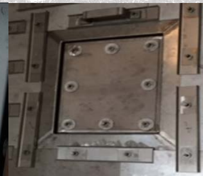
Double seal access door