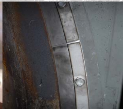
7EA Flex Seal Upgrades