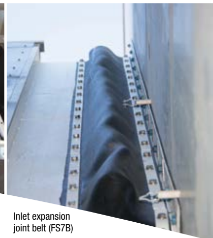
Inlet expansion joint belt (FS7B)

Schock offers retrofit upgrades and complete replacements for your existing Gas Turbine Equipment Inlet Systems. We use both exterior and interior insulated ducts and custom engineered silencing solutions for your exact requirements. With carefully selected partners, we also offer inlet air heating and cooling solutions to maximize your plant's availability and performance.