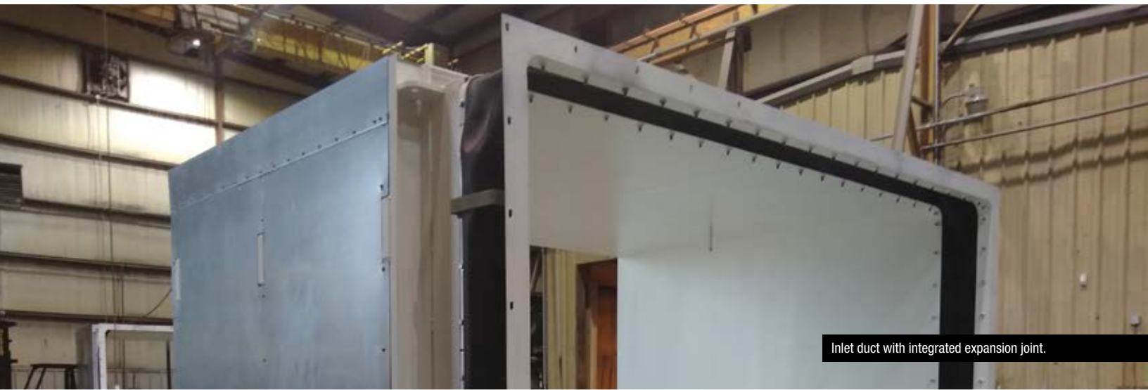
Inlet duct with integrated expansion joint.

Retrofit Upgrades or Complete Replacements