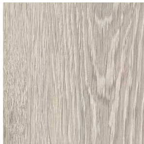
W106 | Gray Oak