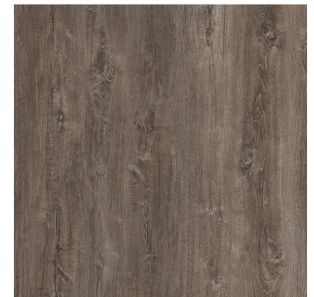
W108 | Chattered Oak