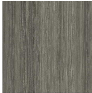
ST202 | Urban Gray