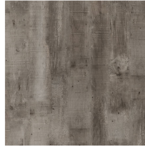
W103 | Reclaim Brown