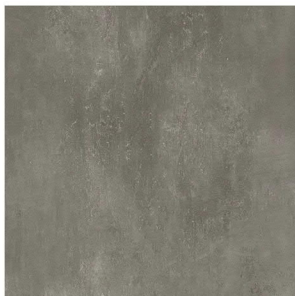
ST204 | Cool Crete