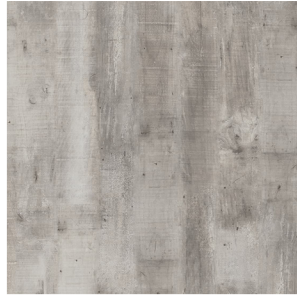
W102 | Reclaim Beige