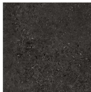
ST208 | Asphalt

The printed images may not be an accurate reproduction of the products' actual colorways. We strive to offer an authentic representation, but images may vary according to press run and digital displays. These images are intended as a guide only. If you would like a sample of this product, please call us 800-588-2300 or https://www.empiretoday.com .