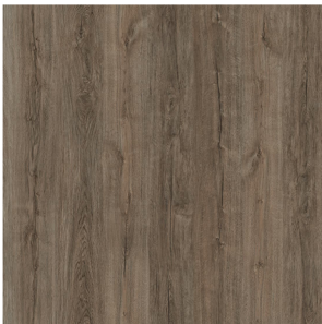
W105 | Oak Taupe