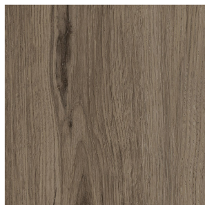
W110 | Coastal Taupe