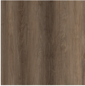
W101 | Walnut