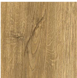
W109 | Harvest Wheat