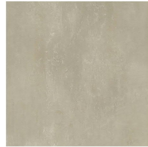
ST203 | Warm Crete