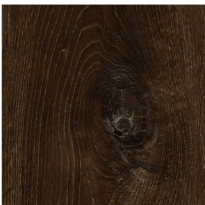
W113 | Espresso