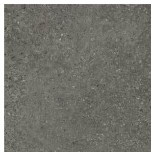
ST207 | Sidewalk