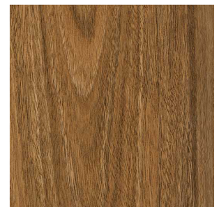
W112 | Honey