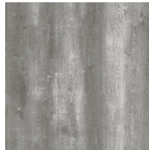
W107 | Historic Gray