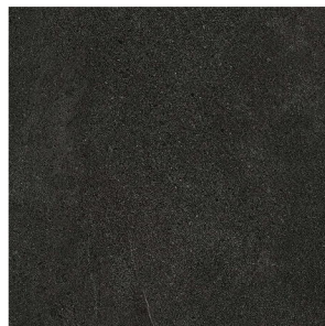
ST205 | Flint