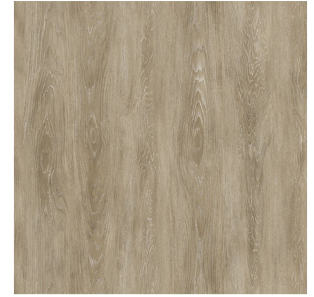
W104 | Brushed Oak