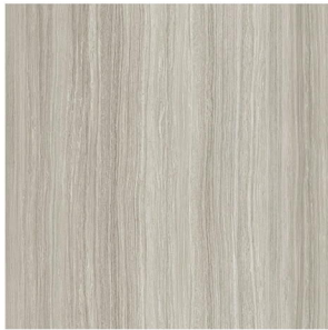
ST201 | Urban Stone