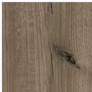
W114 | Shipyard

The printed images may not be an accurate reproduction of the products' actual colorways. We strive to offer an authentic representation, but images may vary according to press run and digital displays. These images are intended as a guide only. If you would like a sample of this product, please call us 800-588-2300 or https://www.empiretoday.com .