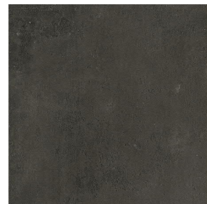
ST206 | Whetstone