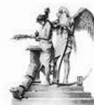
Adopted Arizona Funeral Rite Paradise Valley Silver Trowel #27

Artificial intelligence is no match for natural stupidity.