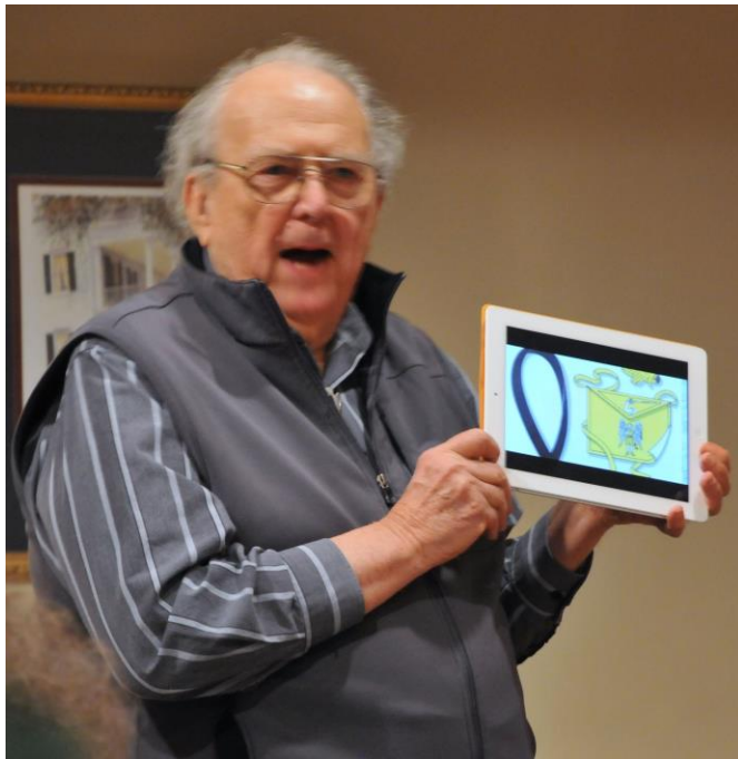
Always the "Teacher"