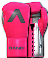
Pretty in pink