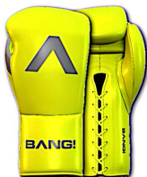
Don't get Lemon