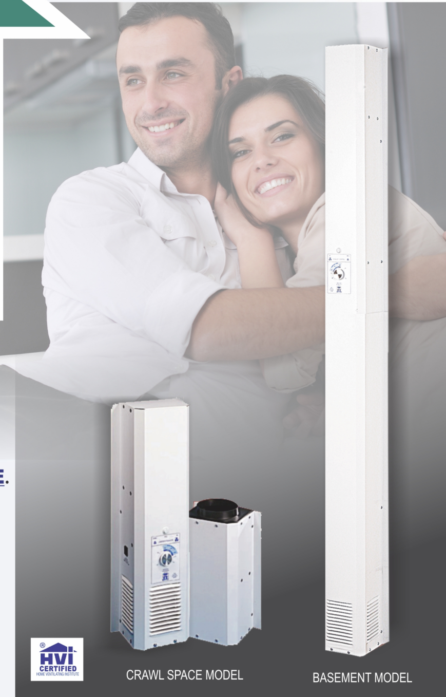
CRAWL SPACE MODEL

Extract INDOOR moisture in basements and crawl spaces created by everyday activities.