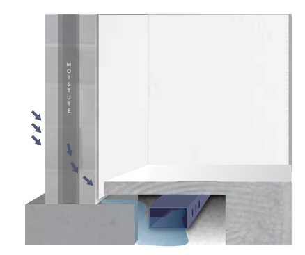
AFTER (OPTION 2) FULL HEIGHT PROTECTION