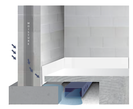
AFTER (OPTION I) COVER WEEP HOLES ONLY