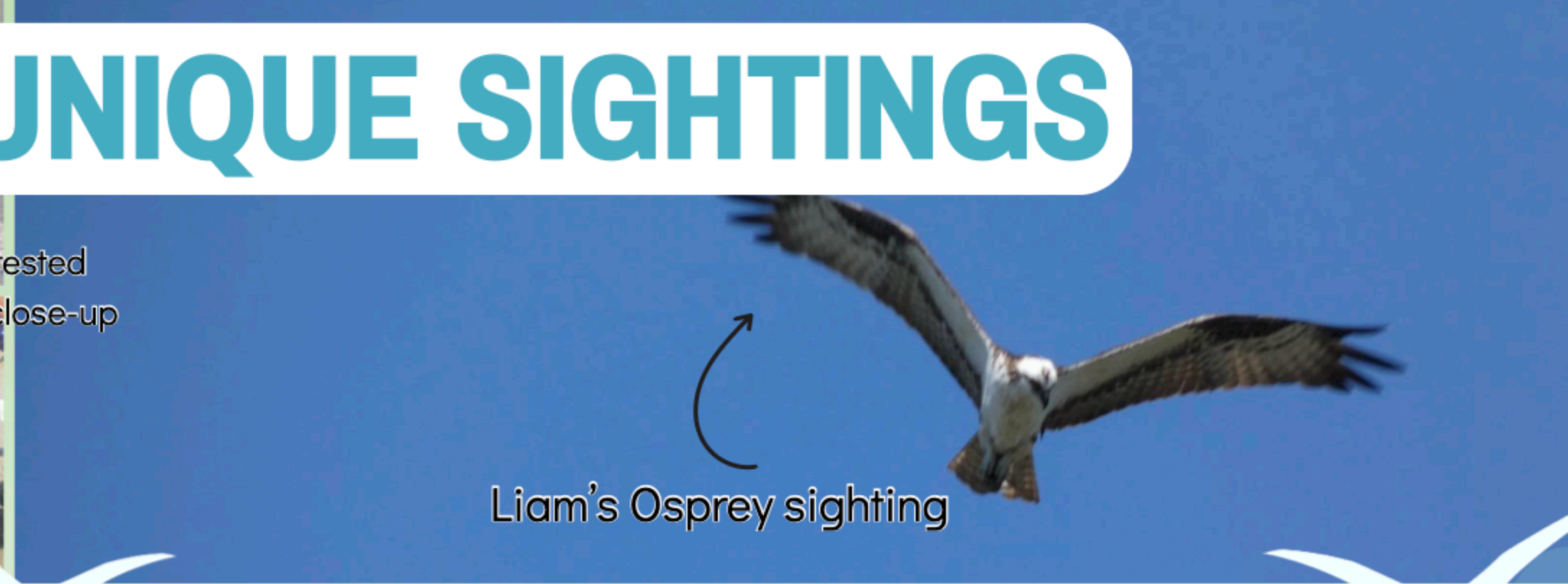
Liam's Osprey sighting