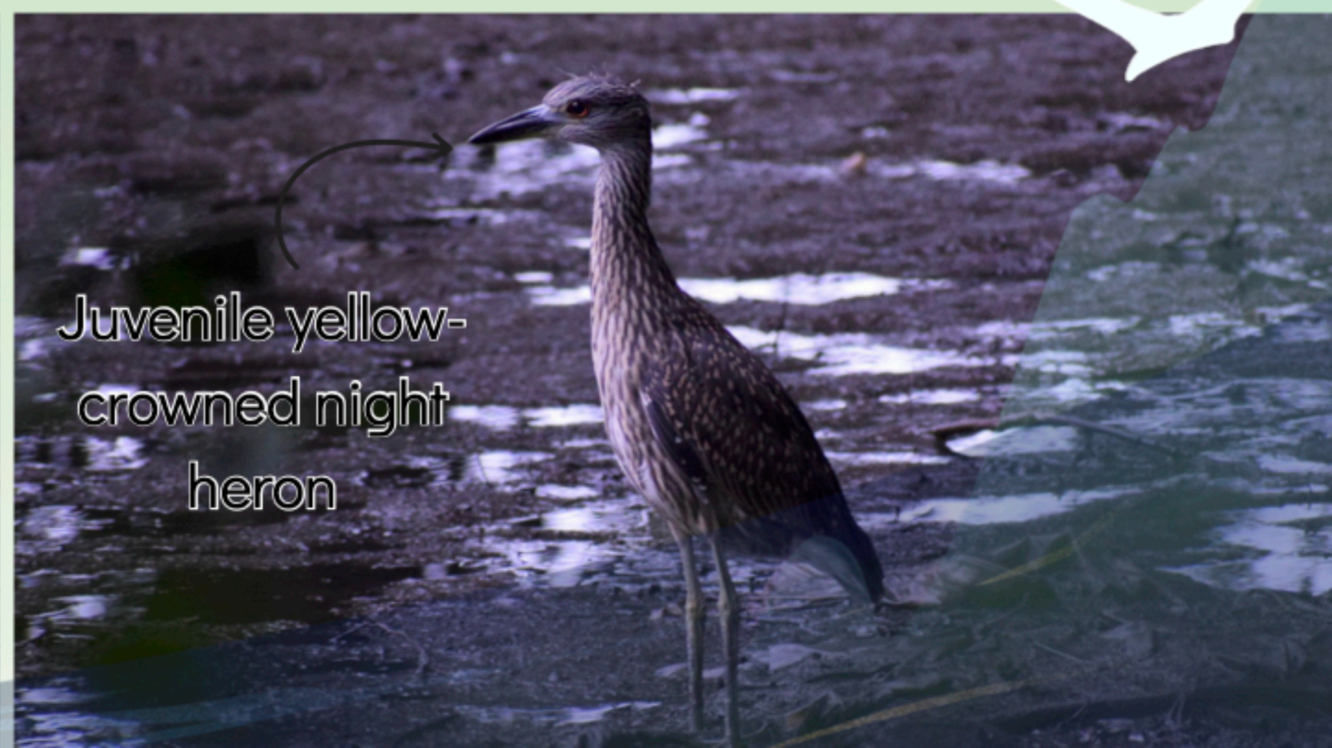
Juvenile yellow- crowned night heron