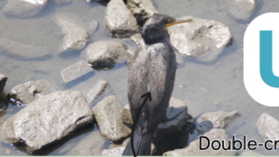
Double-crested cormorant close-up