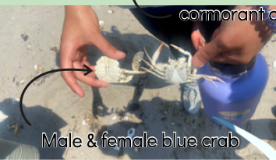
Male & female blue crab