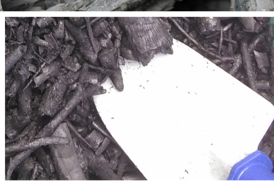
3 - Biochar Produced