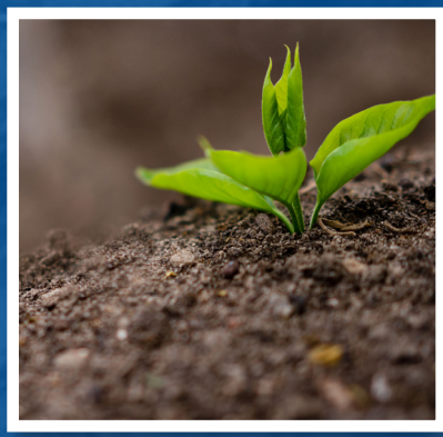
Turn your waste wood into a soil health amendment super power